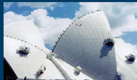
Top left: Aldar HQ, Abu Dhabi Top right: Sydney Harbour Bridge Bottom right: Sydney Opera House

Throughout our long history, we have solved access solutions for all sorts of unique structures. Whether it is a totally exceptional concept like the disc-shaped Aldar HQ in Abu Dhabi, or the classically beautiful sails of the Sydney Opera House, CoxGomyl have provided bespoke access systems to keep them looking their finest.