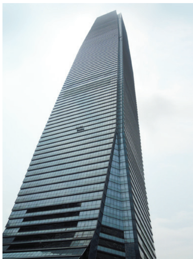
Above: ICC, Hong Kong Below: Shanghai World Financial Center, Shanghai