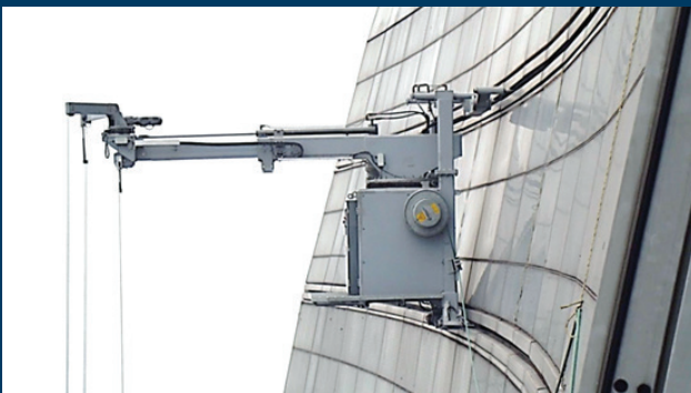
Pearl River Tower, Guangzhou – launched