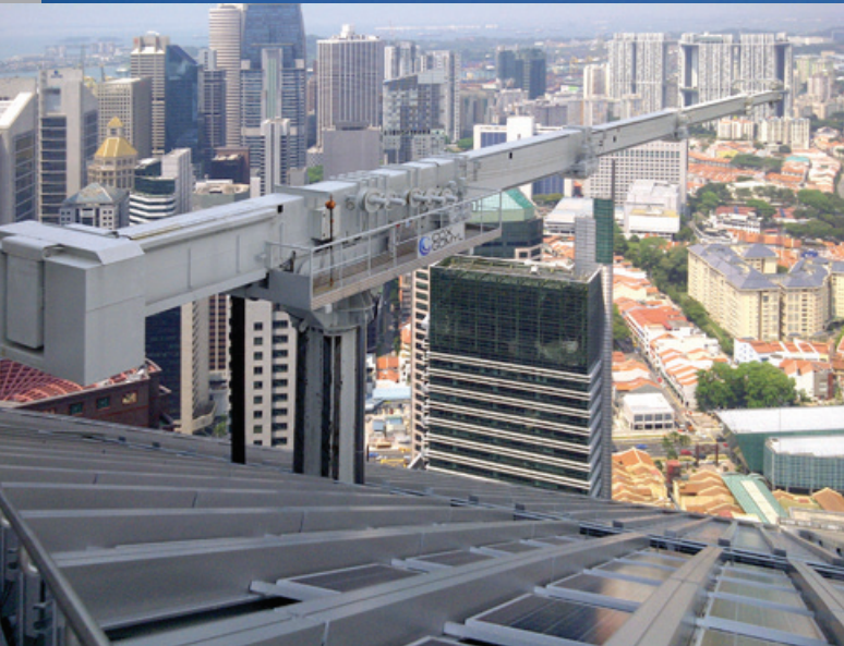
Above: One Raffles Place, Singapore This page: Duke Energy Center, USA

Designers, consultants, constructors or owners are often faced with complicated façade challenges. Whether your building is mega-tall (>600 metres), unusually shaped (such as disc shaped, leaning or spiral plan), or features intricate façades (like protrusions, slopes, recesses or curves), the CoxGomyl designers have a solution. These all make use of CoxGomyl's broad range of expert strategies and methods, such as: