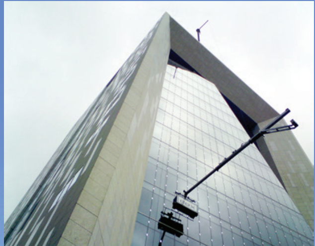
Above: Xinyi, Taiwan- Approaching System This page: Torre Espacio, Madrid – Soft Rope system