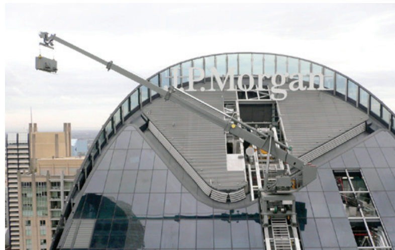
JP Morgan, Sydney

Rack-and-Pinion Systems - Examples include: