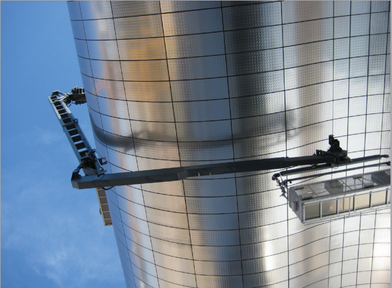
Torre Caja, Madrid