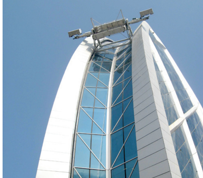
Aldar Headquarters, Abu Dhabi

JP Morgan Building, Sydney - A very large 42-tonne machine with a 26-metre jib climbs a 36-degree glass roof.