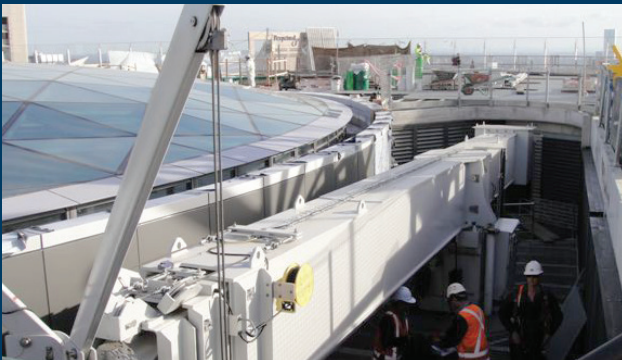
1 Bligh St, Sydney – parked in a pit and then erect