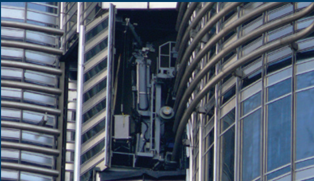
Burj Khalifa, Dubai – launching and then out along the rails