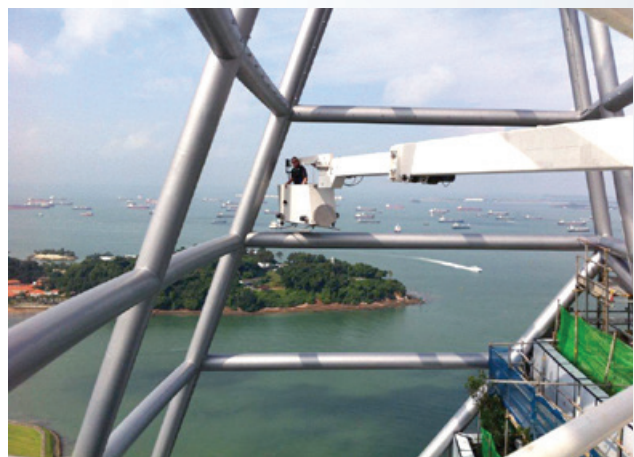
Top: The Shard, London (Top Machine) This page: Reflections, Singapore, multi-knuckle jib

Utilising smart-logic controllers, CoxGomyl designers are able to program launch sequences so that machines automatically navigate their way out of tight conditions. This programmed approach also reduces cycle times, as well as minimising the risk of collision.