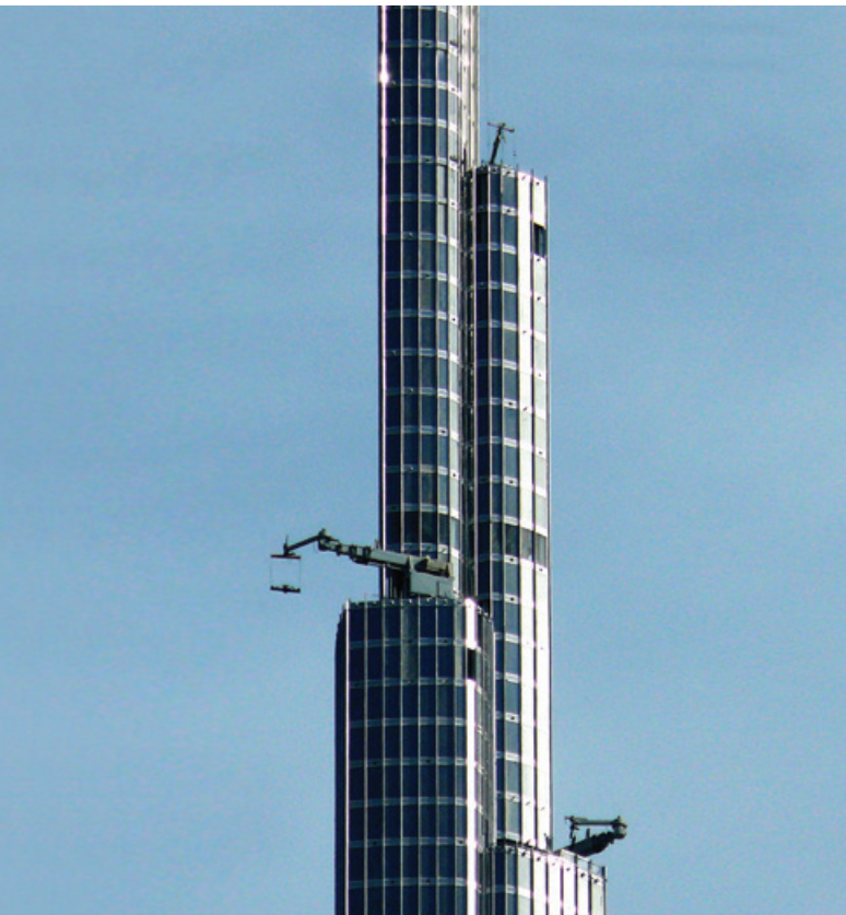
Above & top right: Burj Khalifa, Dubai