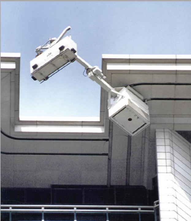
The Peninsula Hotel, Hong Kong