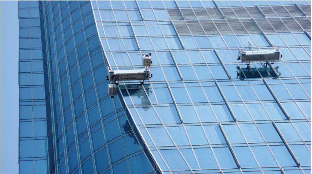
One Island East, Hong Kong