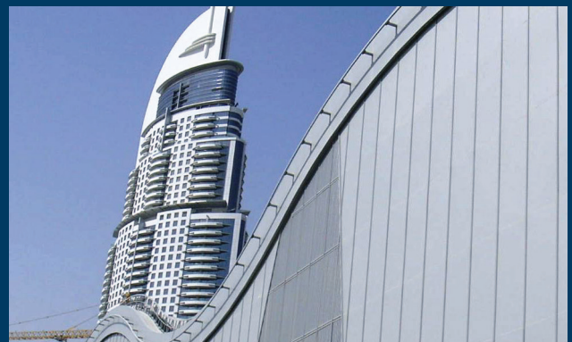
Dubai Mall, Dubai