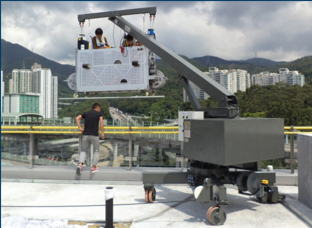
Shing Wan Rd, Hong Kong