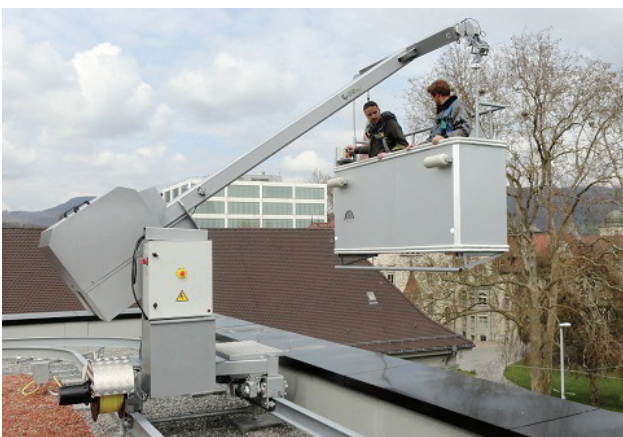
Bahnhofplatz Aarau, Switzerland