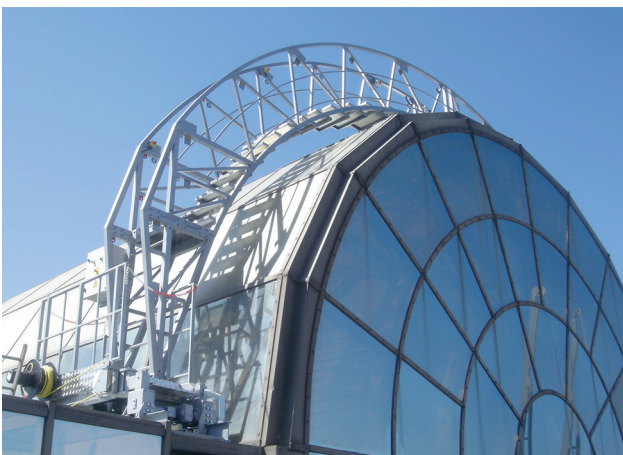
Senate of Spain, Madrid