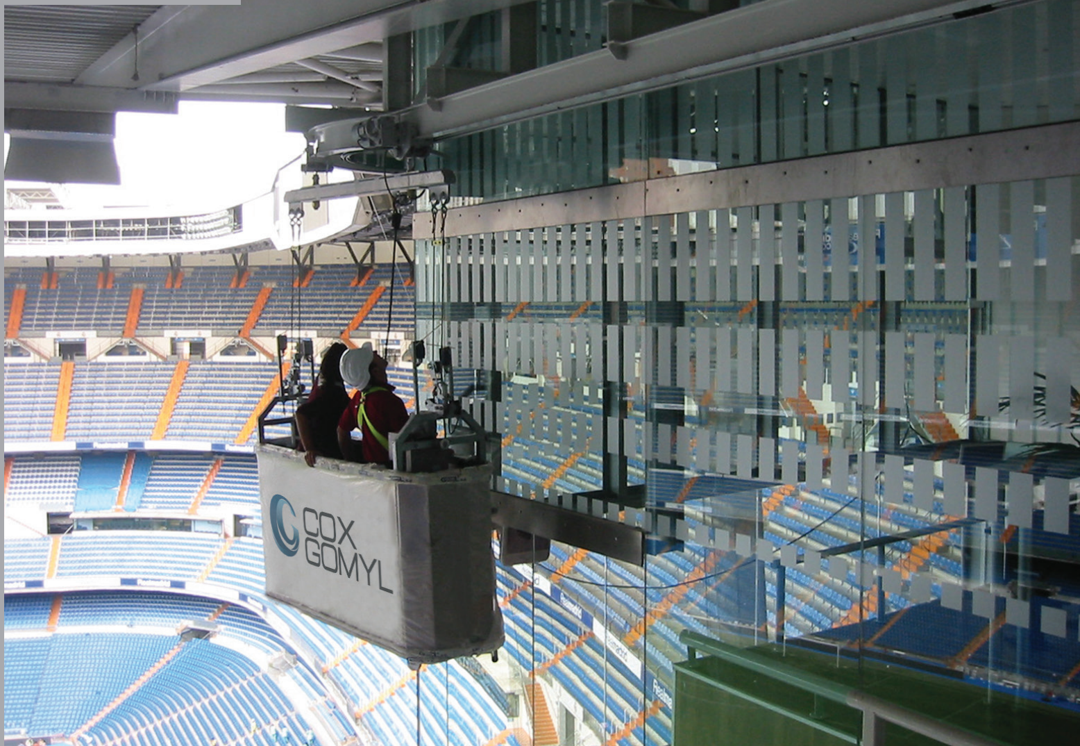
Bernabeu Stadium, Madrid