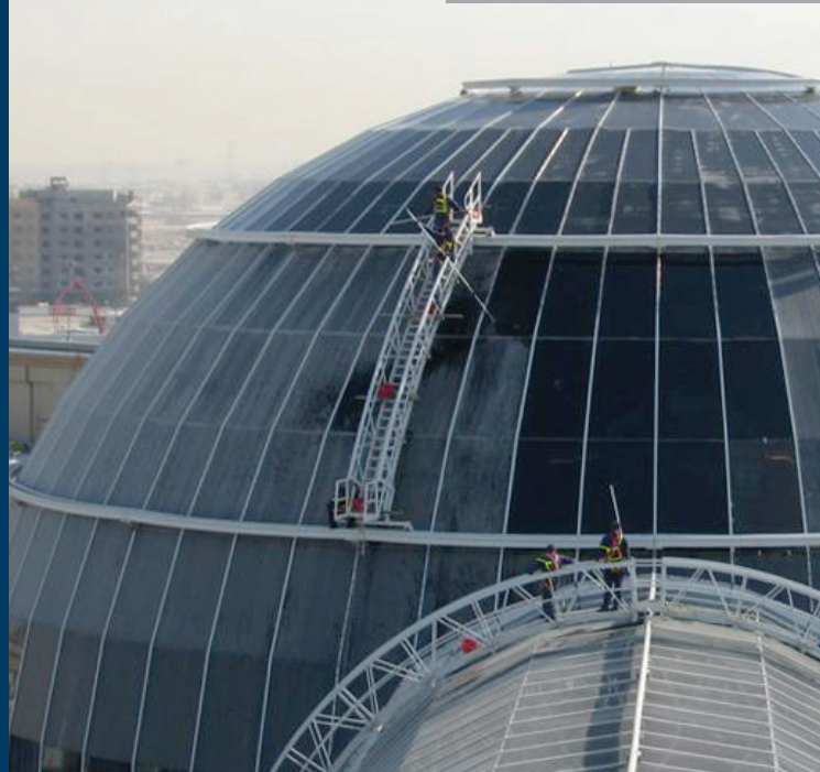
Mall of the Emirates, Dubai

After installing, we remain available to assist with the servicing and maintenance during the DLP period, as well as offering ongoing full maintenance and service packages. There is a peace of mind that comes from having your long-life capital equipment maintained fully by the manufacturer. It ensures up time, a clean and well-maintained building, lower cost of ownership, and ultimately assists in the delivery of your value proposition with clients and tenants.