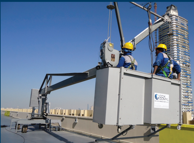
Dubai Mall, Dubai