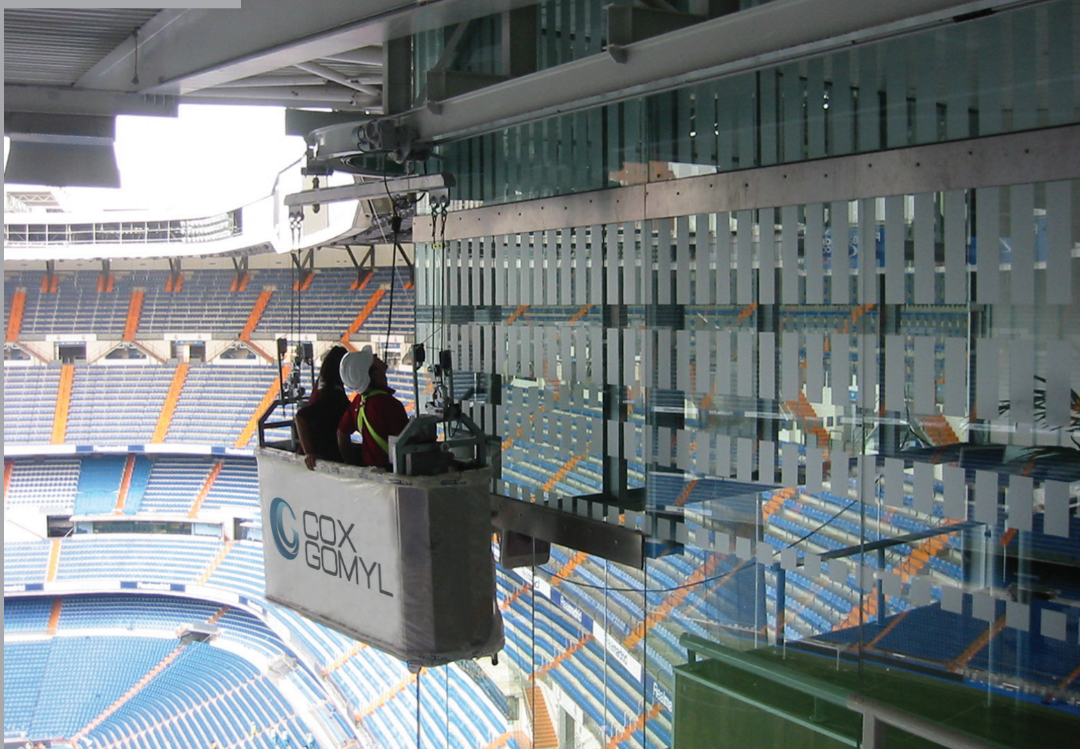
Bernabeu Stadium, Madrid