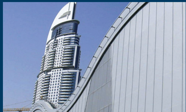
Dubai Mall, Dubai