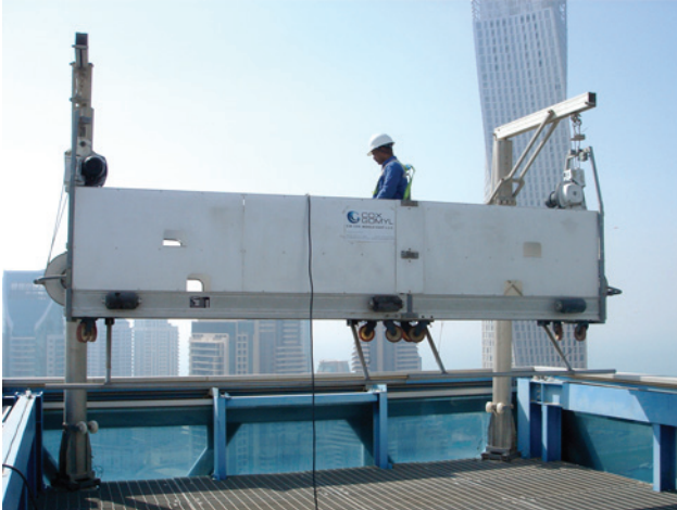
Dubai Marina, Dubai